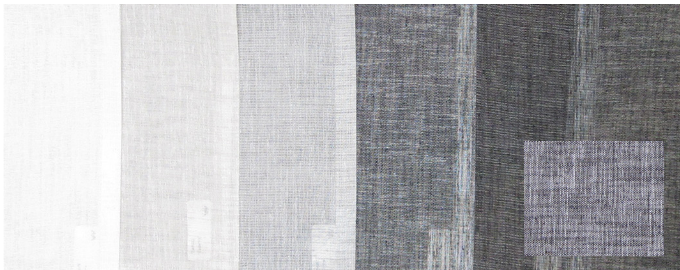
Tahiti Drapery hanger with texture close up

Tahiti is the latest addition to our range of wide width, continuous sheers. Featuring a dry, subtle slubby linen-like texture, this elegant sheer will beautifully filter light whilst providing privacy for your interiors.